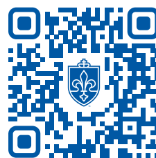
Our Facebook Page